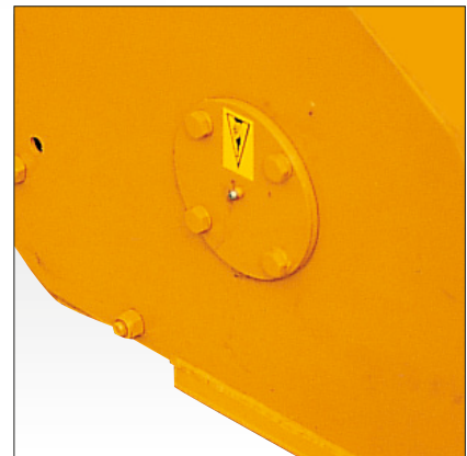
Rotor with internal sealed bearings