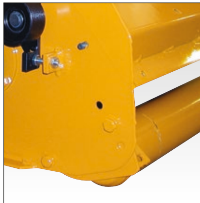
Rear adjustable roller