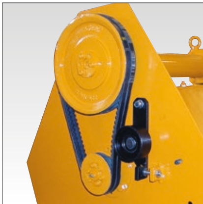
Adjustable belt tension.